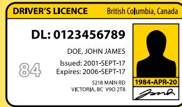
B.C. driver's licence

Provide front and back copies of one of these: